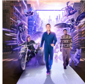
Movie Day - Capri

Today we will be seeing on the big screen Harold and the Purple Crayon at the Capri on Goodwood Road, and we will be going there by school bus and leaving at 9.30am and returning by 12.30pm via the school bus. The children will each be given morning tea from the Candy Shop!!