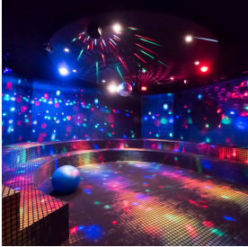
Move It - Disco

Today we will be having Move It come run a Disco session. So, we are going to rip up the D-floor with the children. There will be music, glow sticks, Lazer Lightning. Also, there will be Freestyle dancing in a safe atmosphere allowing every ability of dance to participate and enhance those already confident and also provide a space for those slightly timid to express themselves safely. It's going to be AWESOME!