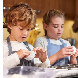
Table Tennis and Cooking Day

You better believe it! Today we will be indulging in some more cooking! Let's put our cooking skills to the test and bake some delicious treats!