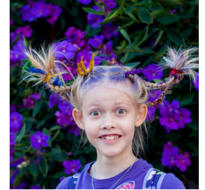
Crazy Hair Day

Today we would like you to come with Crazy Hair so let your imagination go wild and let's see whose hair is the craziest!!